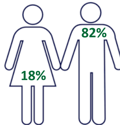
Total # Claims by Protection Type

Total Percentage of claims paid by gender: